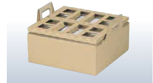
Activated charcoal BOX